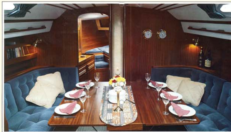
The saloon table accommodating up to ten people

The feeling of luxury and comfort aboard is absolute, and you can enjoy extended periods of exciting sailing without feeling crowded. A sense of space and privacy has been achieved by separating the saloon, galley and navigation area from the three luxurious and well-proportioned cabins. When you have guests, you will find the saloon large enough to entertain up to ten people around the satin-finished mahogany table; the settees are warm and offer the comfort of any fireside armchair.