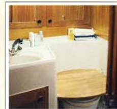
The toilet compartment is roomy with ample showering space.