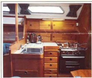
A galley which will satisfy the most demanding chef.

The cockpit, deck and coachroof are teak laid as standard in the Continental version. With regard to equipment, only the best has been considered good enough, from the extra big winches down to the smallest shackle.