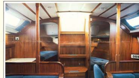
Three comfortable berths in the two separate aft cabins

The feeling of luxury and comfort aboard is absolute, and you can enjoy extended periods of exciting sailing without feeling crowded. A sense of space and privacy has been achieved by separating the saloon, galley and navigation area from the three luxurious and well-proportioned cabins. When you have guests, you will find the saloon large enough to entertain up to ten people around the satin-finished mahogany table; the settees are warm and offer the comfort of any fireside armchair.