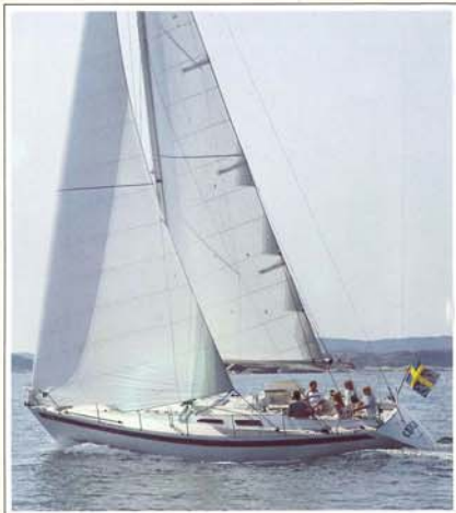
The pace of a true cruiser-racer!

As you can see from the interior pictures, the Sweden Yachts 38 is very well appointed and will give you a comfortable second home. This degree of luxury is especially important for long distance sailing; the Sweden Yachts 38 will meet your highest expectations. The interior is finished in solid mahogany, the fabrics are both durable and attractive, the cabins are functional for living on board both at sea and in harbour.