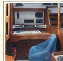
The navigation area is spacious and is equipped with an ingenious fold-down instrument panel.