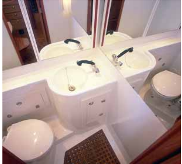
Aft head compartment, complete with toilet, shower and storage space.

The interiors of the washrooms and shower areas echo the design philosophy of the whole yacht – design for functional performance in combination with eye-appeal.