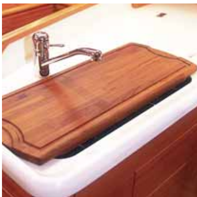
It fits tailor made chopping-board.