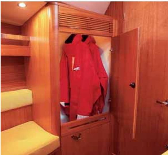
Well vented wardrobe.