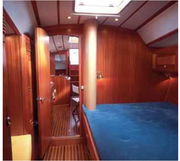
Owner's cabin looking aft.