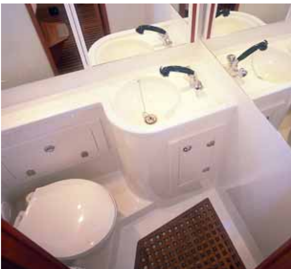
Head compartment with toilet and shower.