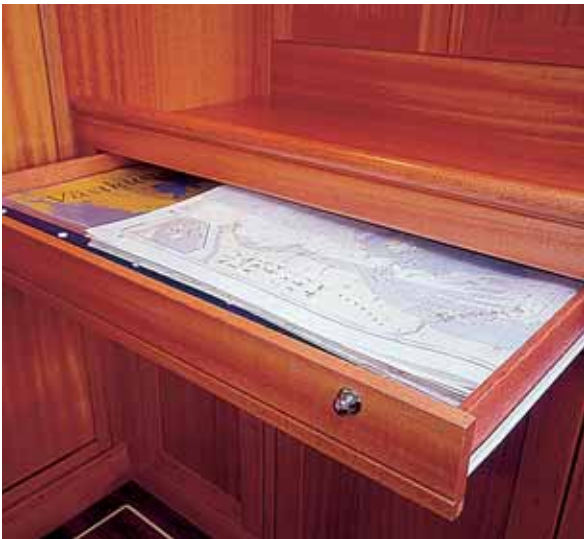
Handy storage for charts etc.