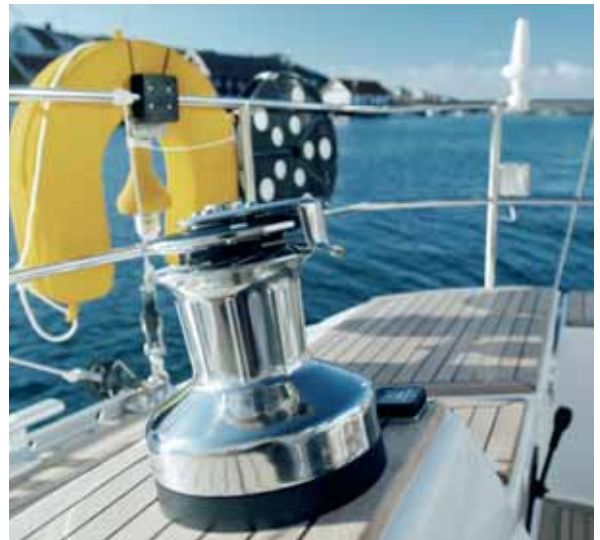
Stainless steel winches.

Like all yachts from the Sweden Yachts yard, the Sweden Yachts 42 is equipped with only the very best gear and systems. Every item has been selected with outmost care and then tested extensively before being allowed on board the yacht. As always, function and elegance go hand in hand.