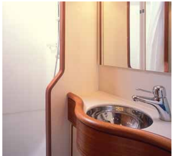
Designed with a soft touch.