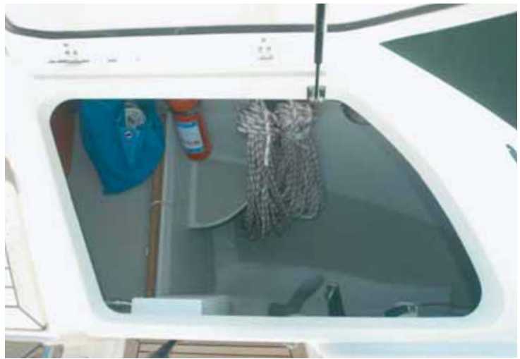
Stowage space aplenty.