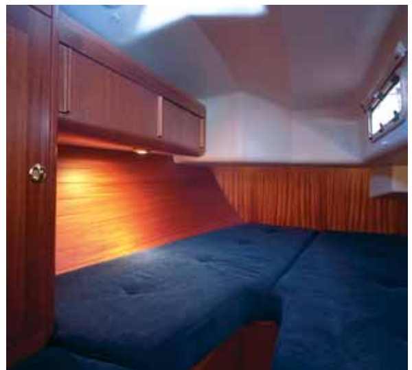
One of two aft double cabins.