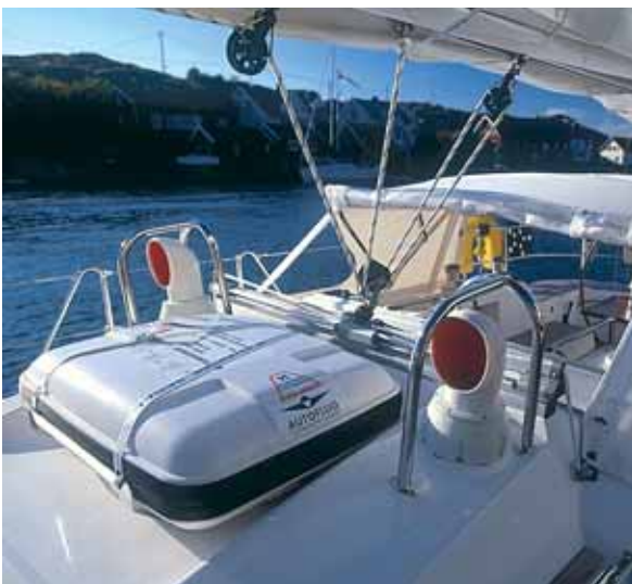
Balanced main sheeting.