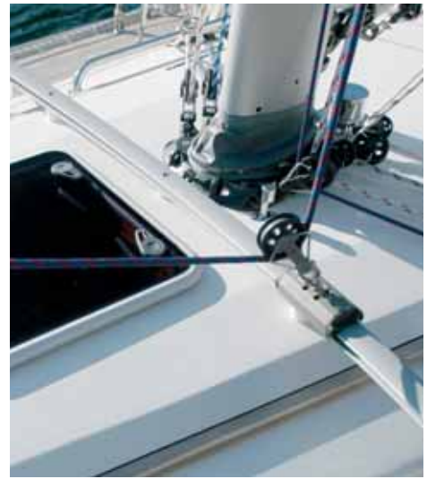
The self-tacking jib track is well positioned with the sheet running from the car up the mast before being led aft to the cockpit.