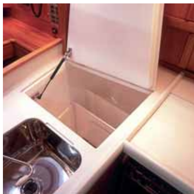
Freezer and fridge.