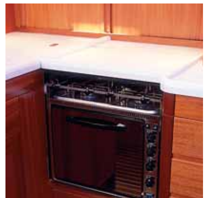
The pull-out cover hides the cooker.