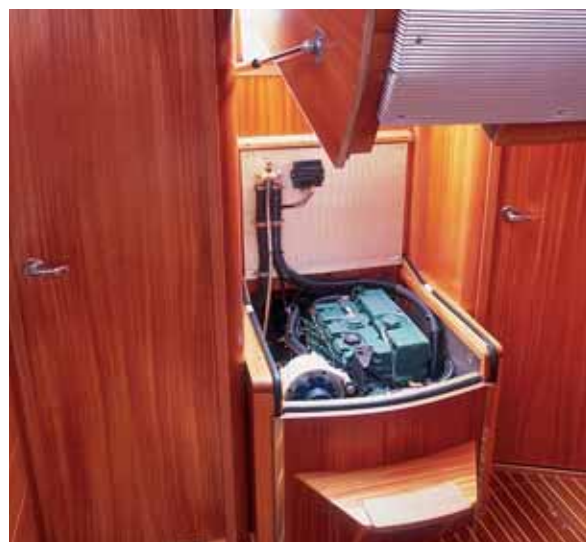
... gives full access to engine.