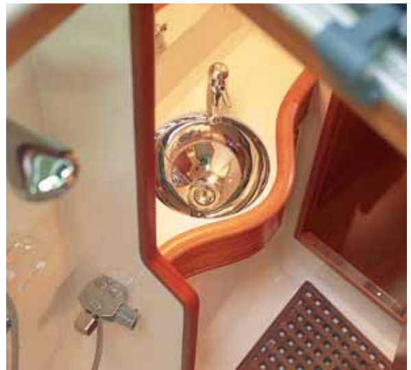
Head compartment in owner's cabin with toilet and shower.