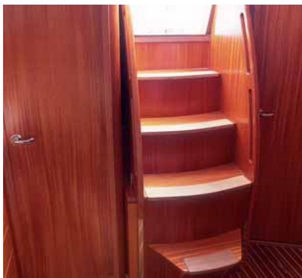
Gas strut operated staircase ...